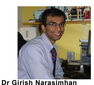
MB BS (1999 India) MRCGP